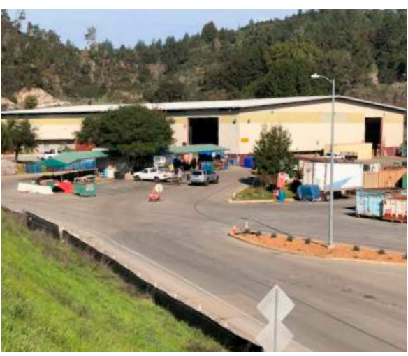
Ben Lomond Transfer Station