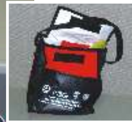
◀ Reusable lunch bag