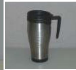
◀ Reusable beverage cup

Learn how our Commercial Waste Reduction Program can turn your company into a more efficient and environmentally-friendly business (details on Page 2).