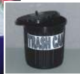
◀ Mini waste can