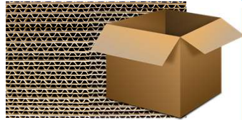
Clean Corrugated Cardboard