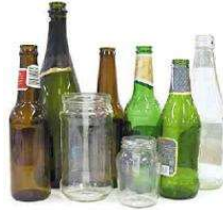
Clean Glass Bottles & Jars