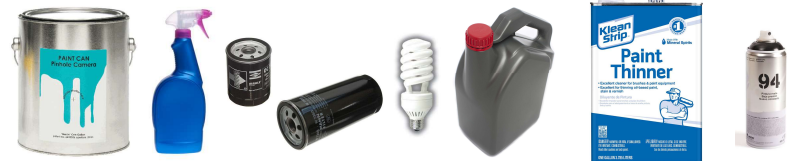
Buena Vista Household Hazardous Waste (Businesses Pay a Fee) Open Every Wed, Fri, & Sat 7:30am - 3:30pm – Questions? 831.454.5331

Not sure what we accept? Call 831.454.5153 or visit SantaCruzCountyRecycles.org