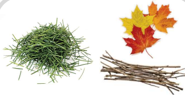
Yard Waste & Tree Trimmings