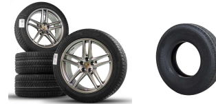
Tires with or without Rims