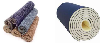
Clean Carpet & Carpet Foam Pad