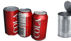
Clean Aluminum & Metal Cans