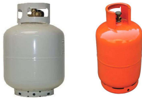
Propane Cylinders (No more than 5 gal. in size)