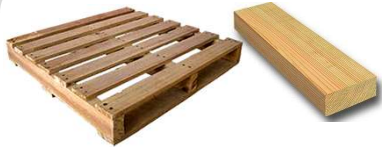
Untreated Wood/Lumber (No Painted Wood)