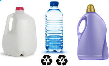
Clean Plastic Bottles, Jugs & Jars