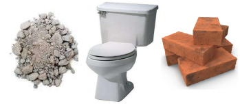
Asphalt, Tile, Base Rock, Brick, Porcelain